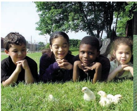
East Rock students document science projects with a digital camera, then print reports on their Phaser 840 color printer.

East Rock's Phaser 840 color printer is a great source for printing the school newspaper: