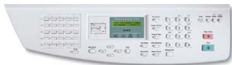
FaxCentre F12's intuitive control panel