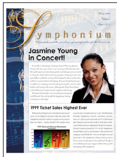
Graphic File 32% Coverage