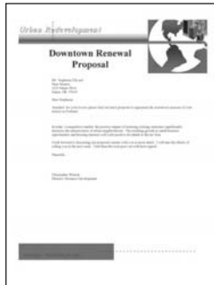
Monochrome Business Letter 5% Coverage