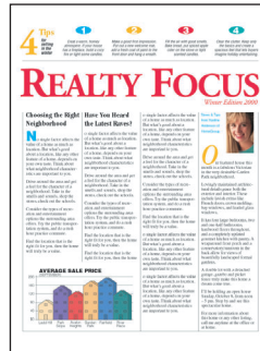
Newsletter 15% Coverage